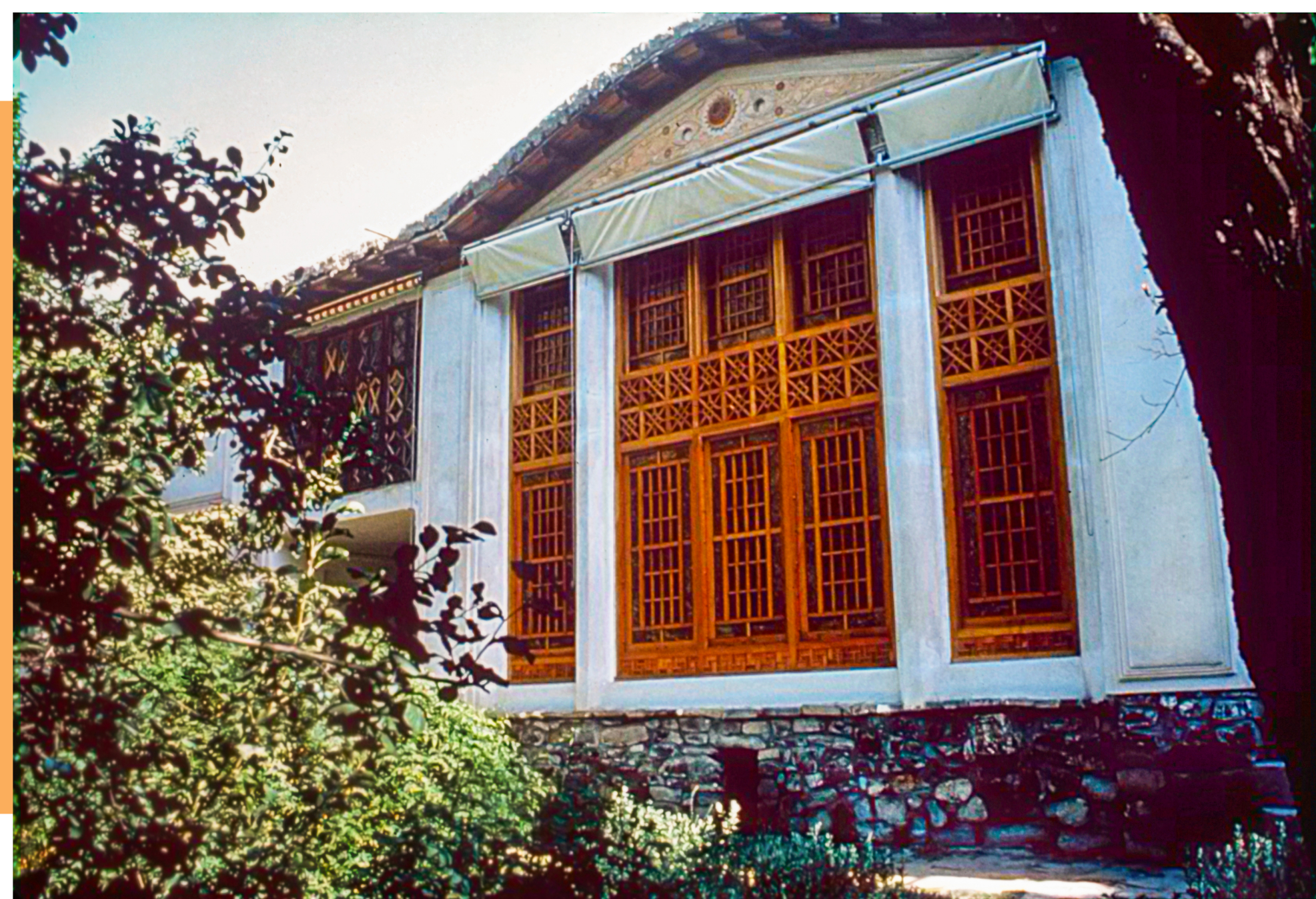
Childhood home of Baha'u'llah

The teachings of the Founders of the world's religions have inspired breath-taking achievements in the arts and sciences. These uniquely endowed individuals are referred to as "Manifestations of God" in the Bahá'í writings, and include (among others) Krishna, Abraham, Moses, Zoroaster, Buddha, Jesus Christ, Muhammad, the Báb, and Bahá'u'lláh. History provides countless examples of how these Figures have awakened in whole populations capacities to love, to forgive, to create, and to overcome prejudice. These achievements can be recognized as the common spiritual heritage of the human race.